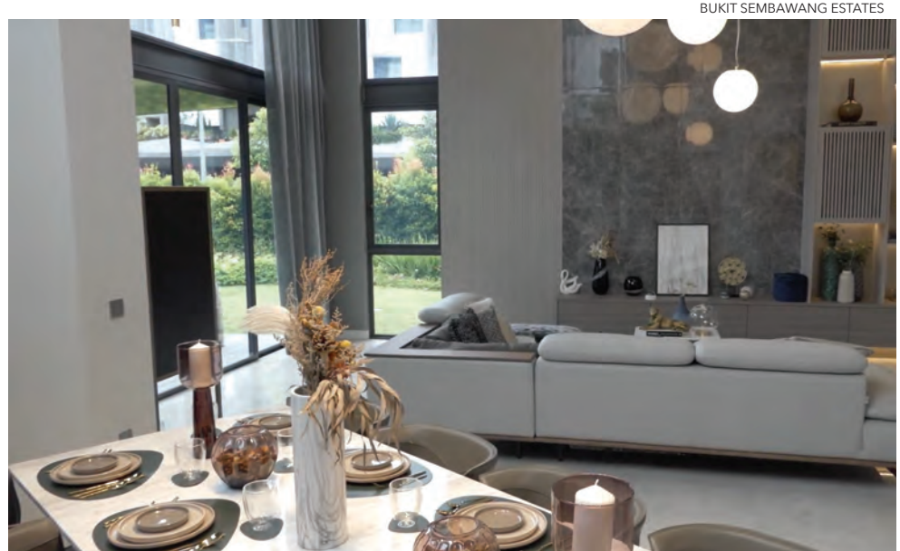
The living and dining area on the first level, like every level of the house, offers multiple views and connections to the outdoors