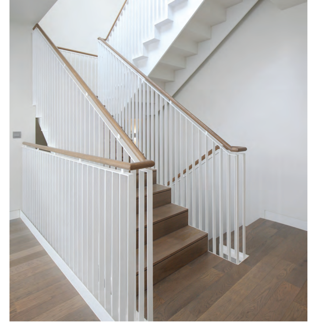
The staircase and balustrades evoke a "nostalgic feel